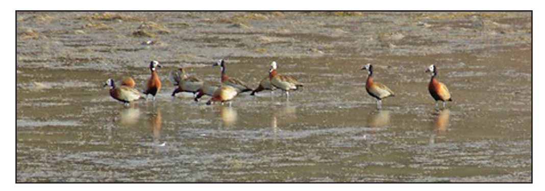
Plate 2. White-faced Whistling Ducks Dendrocygna viduata, Qariya Lagoon, Socotra, 18 February 2020.

the end of June 2020, only one bird remained at Sirhan Lagoon. The habitat occupied by the birds is illustrated in Plate 2. The Qariya Lagoon regularly attracts migratory waders and other wetland birds.