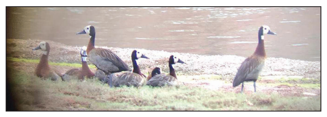
Plate I. White-faced Whistling Ducks Dendrocygna viduata, Qariya Lagoon, Socotra, 27 January 2020.