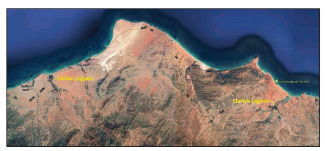
Figure 1. Central northern Socotra showing the location of Qariya Lagoon and Sirhan Lagoon.

On 27 January 2020, while surveying Qariya Lagoon (Fig. 1) close to the north coast of Socotra, I discovered a group of 12 ducks that were unfamiliar to me (Plates 1 & 2). They were not included in the field guide of Porter & Aspinall (2010), but they were similar in shape to the whistling ducks illustrated in that guide and I soon realised they were Whitefaced Whistling Ducks Dendrocygna viduata , the first record of the species for Socotra, Yemen and the Arabian Peninsula. The birds remained at Qariya Lagoon in a wadi running from the lagoon near the village of Ketale, but by early March they had moved to Sirhan Lagoon close to Hadibu, Socotra's capital. At the time of submitting this paper at